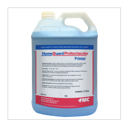
HomeGuard Protectacote Primer 5L