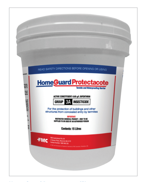
HomeGuard Protectacote 15L